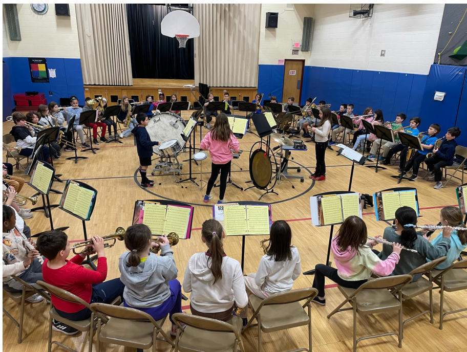
BELOW: Griswold Band Students rehearse in a circle to help improve ensemble performance skills.