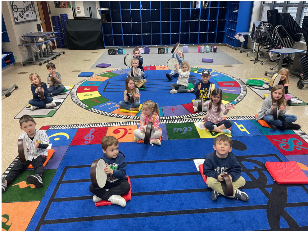
BELOW: Griswold 1st-grade students practice keeping a steady beat on drums.