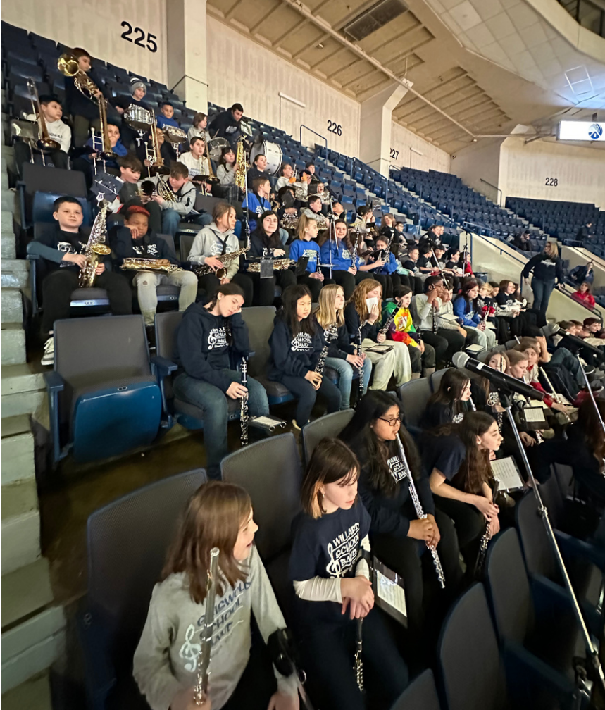
LEFT: Elementary Band Students performed at the March 1st Wolfpack game at the XL Center!