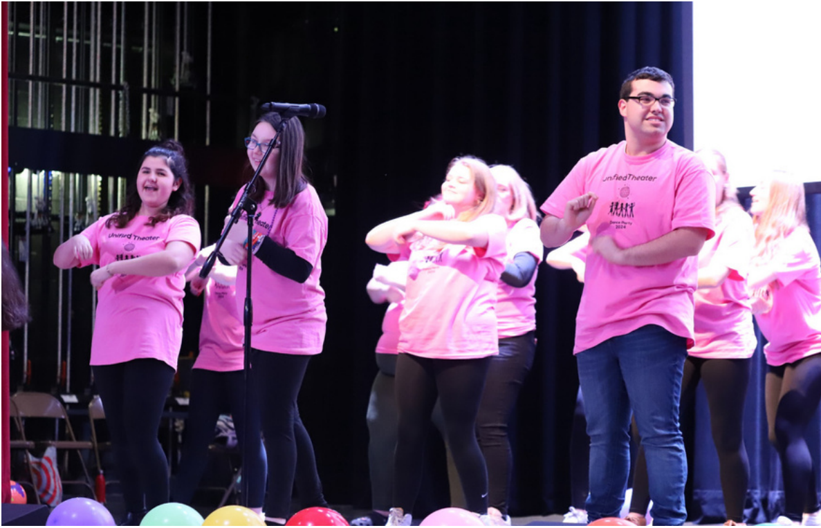
Unified Theatre's production of "A Night at the Dance." Students wrote, directed, rehearsed, and performed their own show, and the audience absolutely loved it!