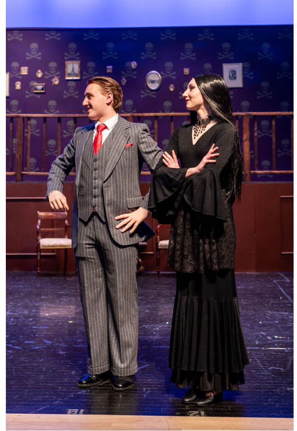
Scenes from the BHS production of "The Addams Family."