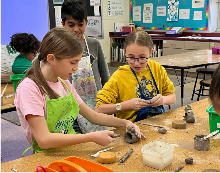
ABOVE LEFT: Griswold 5th-grade students building clay monsters.