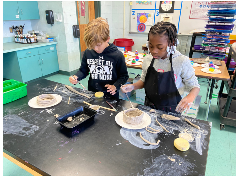
ABOVE RIGHT: Hubbard 3rd-grade students using the coil method to create a clay vessel.