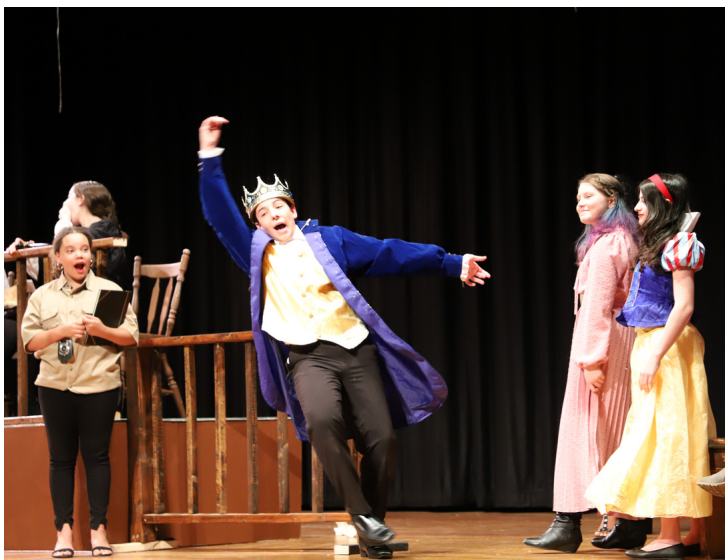
Scenes from McGee Drama Club's production of "Fairytale Courtroom."